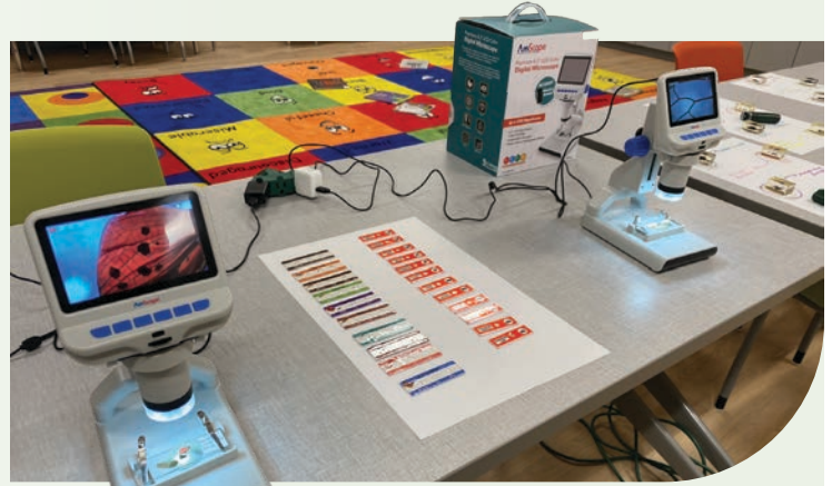
Exploring with Microscopes: Children of all ages can zoom in on the world around them using microscopes and magnifying glasses. Shown under the microscopes above are a lanternfly wing and a cicada wing.

Scan to learn more at: LancasterPublicLibrary.org